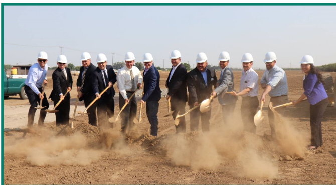
Local officials celebrate groundbreaking of Campus Parkway Segment II at the intersection of Campus Parkway and East Childs Avenue.

The overall Campus Parkway Corridor project consists of a four-lane divided roadway extending 4.5 miles from Mission Avenue to Yosemite Avenue. Segment I from Mission Avenue to East Childs Avenue was completed in 2009. Work on the remaining portion of the project (Segment III) is anticipated to begin next year. The final segment is the largest portion of the project and will extend the expressway to Yosemite Avenue. The entire Campus Parkway Corridor project is anticipated to be complete by June 2023 at a total cost of $100 million.