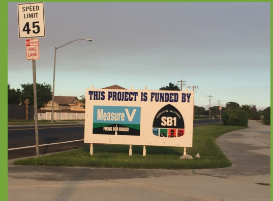
Measure V sign spotted on Overland Drive in Los Banos