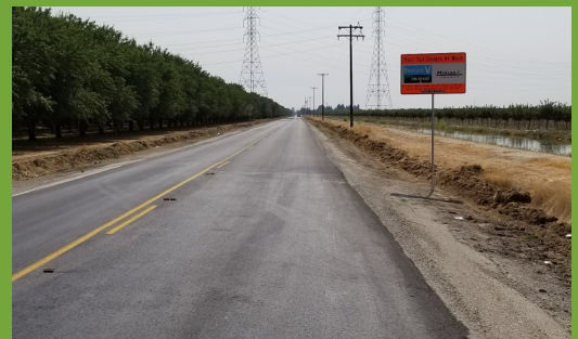
Measure V at work on S. Bear Creek in Merced County

Snap a picture and send it to measurev@mcagov.org or tag us on Facebook @mcag.merced or Twitter #MercedCAG