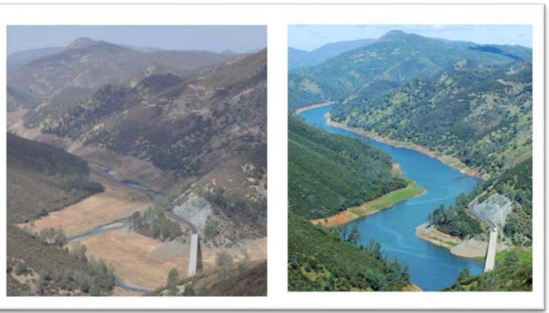
Left: Lake McClure in 2014; Right: Lake McClure in 2011

The Problem: The current supply of available water in California is woefully inadequate. The state has been severely impacted by the current multi-year drought and subsequent reductions to its water supplies used for both municipal and agricultural farming operations. Without precipitation, surface water is rapidly depleting and groundwater is being pulled from the ground faster than it is recharging. Lake McClure in eastern Merced County remains at 9% capacity and will provide no water to eastern Merced County this year. The west side of the county is dependent on federal and state water contracts and anticipates receiving zero allocation of water in 2015.