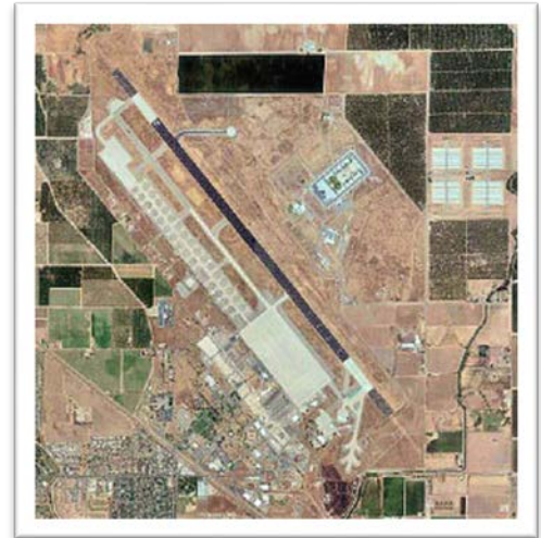
Aerial: Former Castle AFB

Merced County is committed to developing the former Castle Air Force Base into a commercial hub for the region. As part of the Master Plan for Castle Commerce Center and Castle Airport, mapping the above-ground and underground infrastructure and investing in specific infrastructure improvements are necessary to allow for proper development and to fully realize the economic potential of the site.