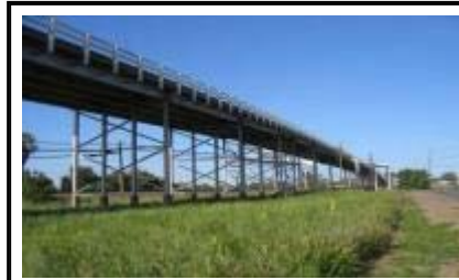
Bradley Overhead in Merced is scheduled for replacement in 2011.